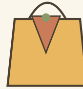
on your bag