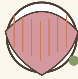
on your head